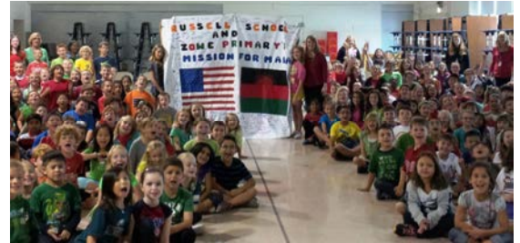
Russell students pose around a banner they made to signify their partnership with Zowe School