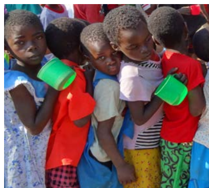
Students eagerly await school breakfast, which is facilitated by community volunteers.

All three breakfast programs resumed in September with the start of school. The program, which is 100% community-run, serves nearly 1,300 students who do not have any food during the hours they are at school.