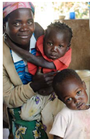
Pamoza is helping food insecure households like this one.

Eighty percent of Malawians depend on subsistence agriculture and this year was a particularly challenging one for the harvest. Dry spells led to meager crop production and 40% of the households Pamoza serves are at risk of severe hunger beginning in December. With generous support from our donors, we raised $13,000 for emergency